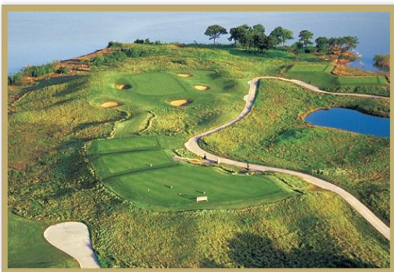
ATOMA Linda Cole Golf Tournament Friday, June 14, 7:00 a.m. The Tribute Golf Course 1000 Lebanon Road, The Colony