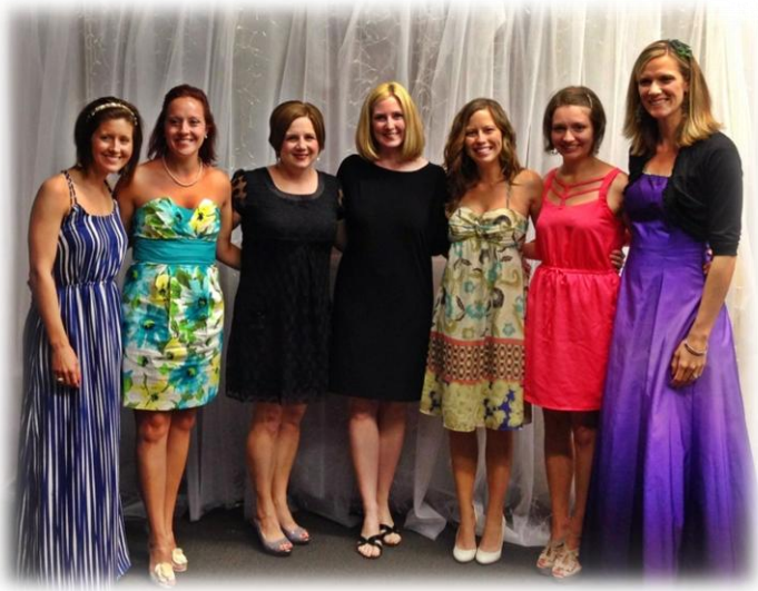
Senior SAA Members receive scholarships from ATOMA.