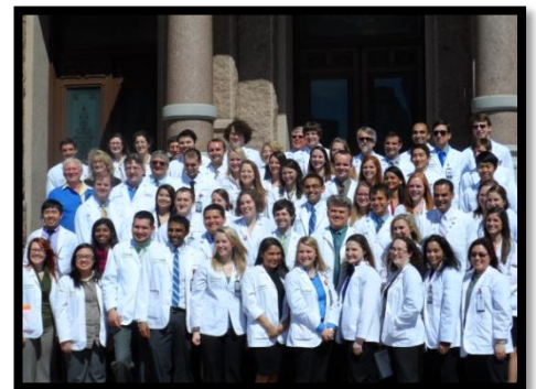
DOME Day 2013 ~ Texas State Capitol ~ Austin, Texas