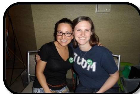
SAA Members sell t-shirts at Mid-Winter

www.cancer.org/cancer/news/features/coloncancer-prevention-and-early-detection-what-you-need-to-know