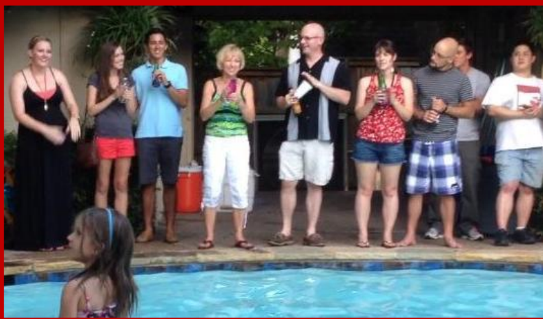
Students enjoyed meeting TOMA physicians at the Baker Pool Party on July 28 th